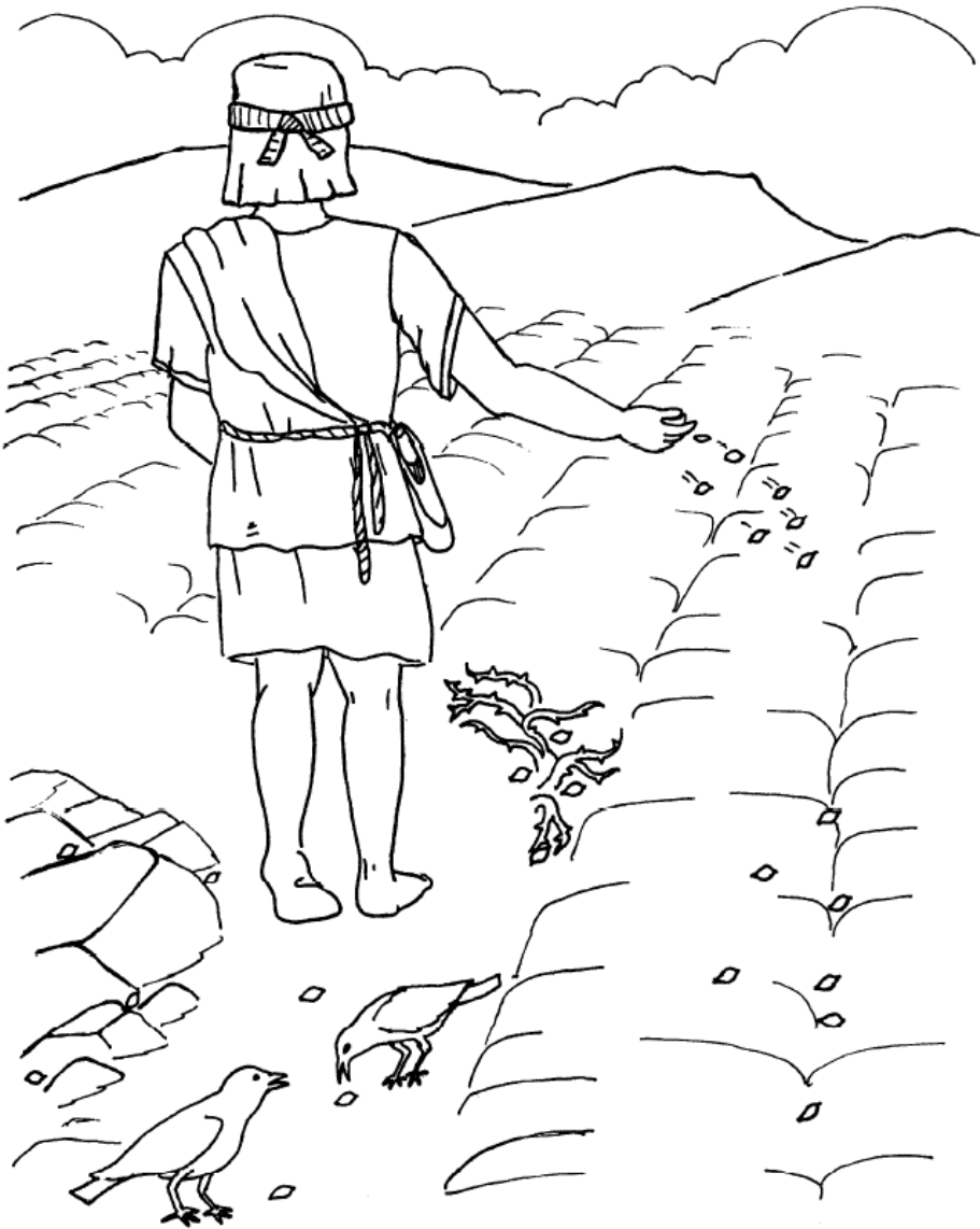
The Parable of the Sower

Copyright © CalvaryCurriculum.com Used by Permission